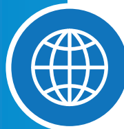
Exhibit for 3 days get a full year of advertising

The organizing committee will organize a wide range of exhibitors to visit key manufacturing enterprises and projects in Indonesia. At the same time, the "Indonesia Auto Parts Development Forum" and the "Indonesia Fastener Industry Investment Forum" will also be held to keep up with the best.