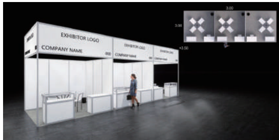
Deluxe Shell Scheme