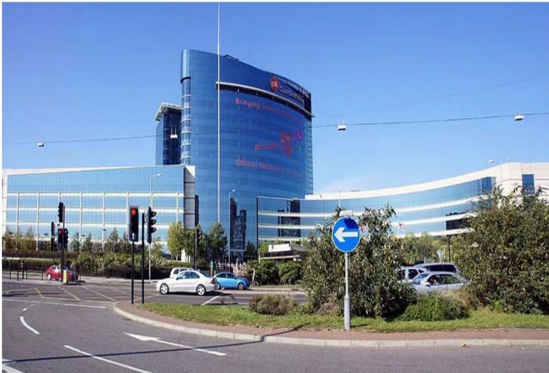
GlaxoSmithKline headquarters in Brentford, London

And on Jan. 1, 2017, GlaxoSmithKline's consumer business head Emma Walmsley took the helm of the company, becoming the first woman to be chief executive of a major pharmaceutical corporation.